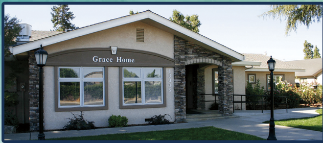
Grace Home as it is today ▲

In 1958 Grace Home opened with eight rooms and capacity for fifteen residents. Labor was donated to build the facility for a cost of $45,850. Estimated cost for such a facility was $125,000 ($1 million in 2019). In 1964 the home was expanded to accommodate 25 residents. The operating capital has been subsidized by the local Mennonite Churches since 1958.